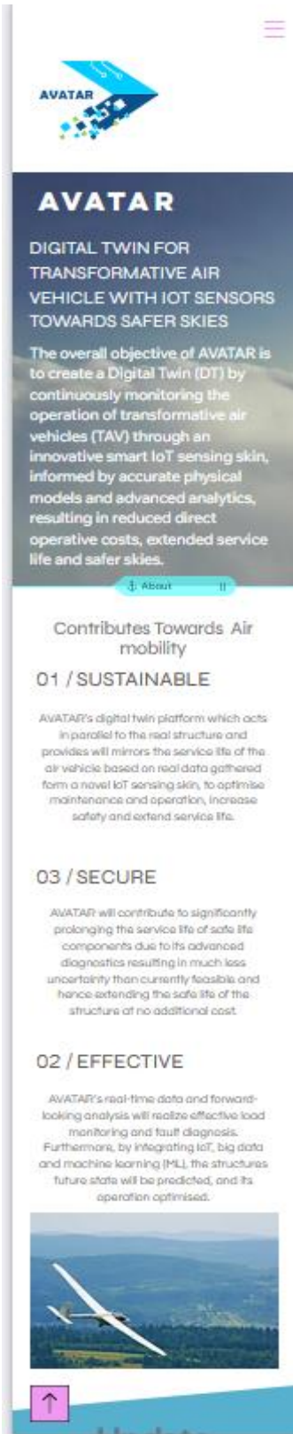
Figure 3. Mobile site